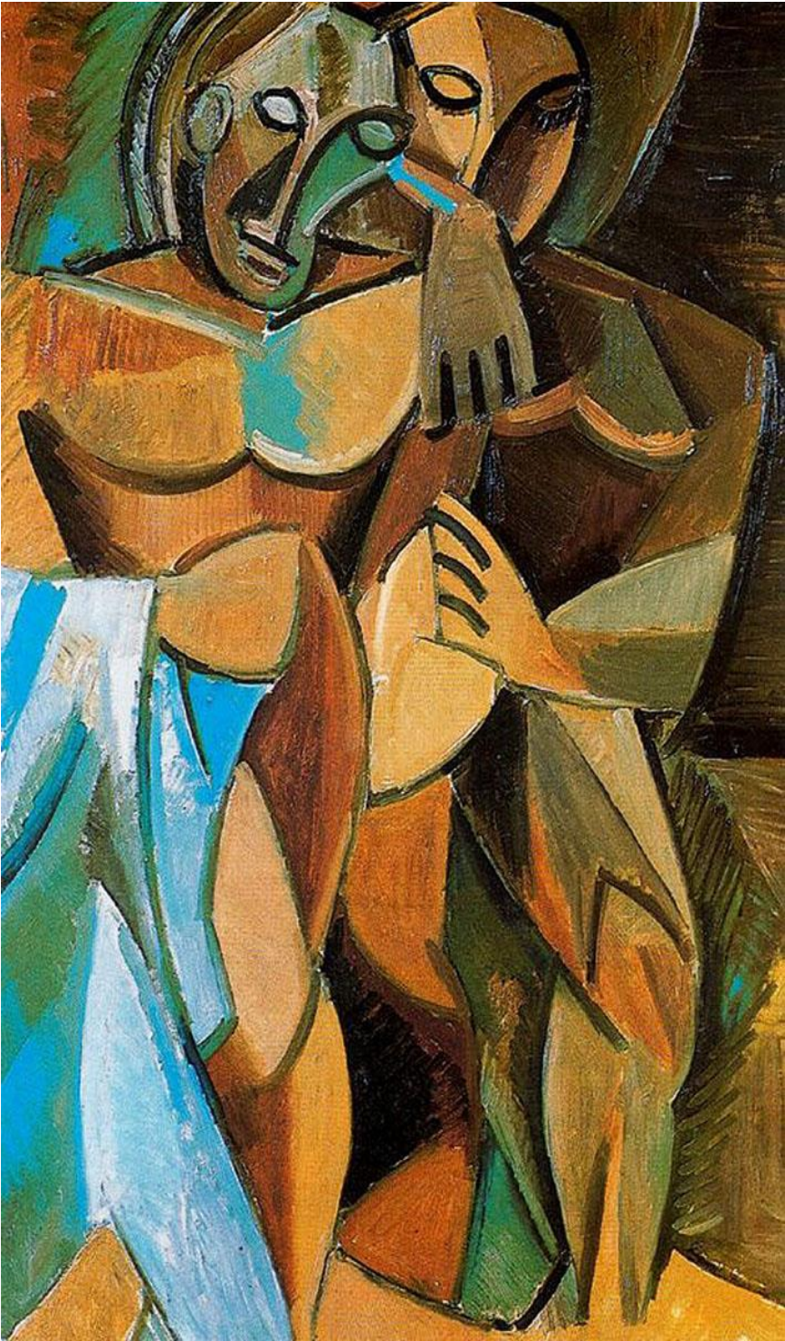
Friendship , Pablo Picasso, 1908, public domain

TAZEWELL PRESBYTERIAN CHURCH Black’s Presbyterian Chapel