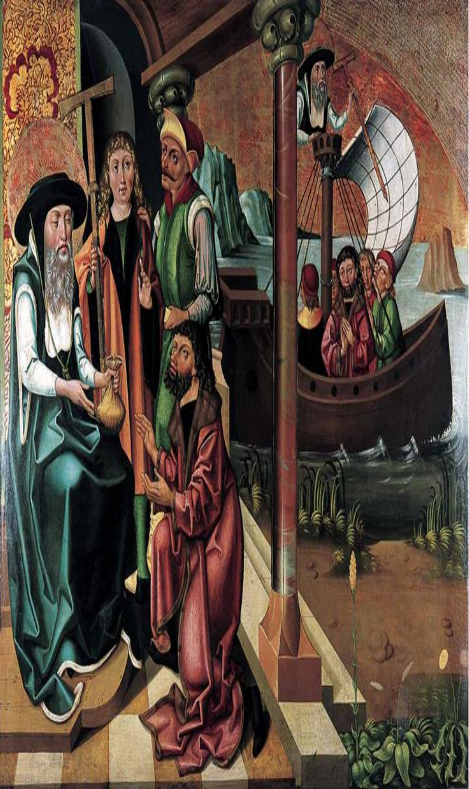
John the Merciful Aiding Impoverished Merchant, 1497-1519, Artist Unknown