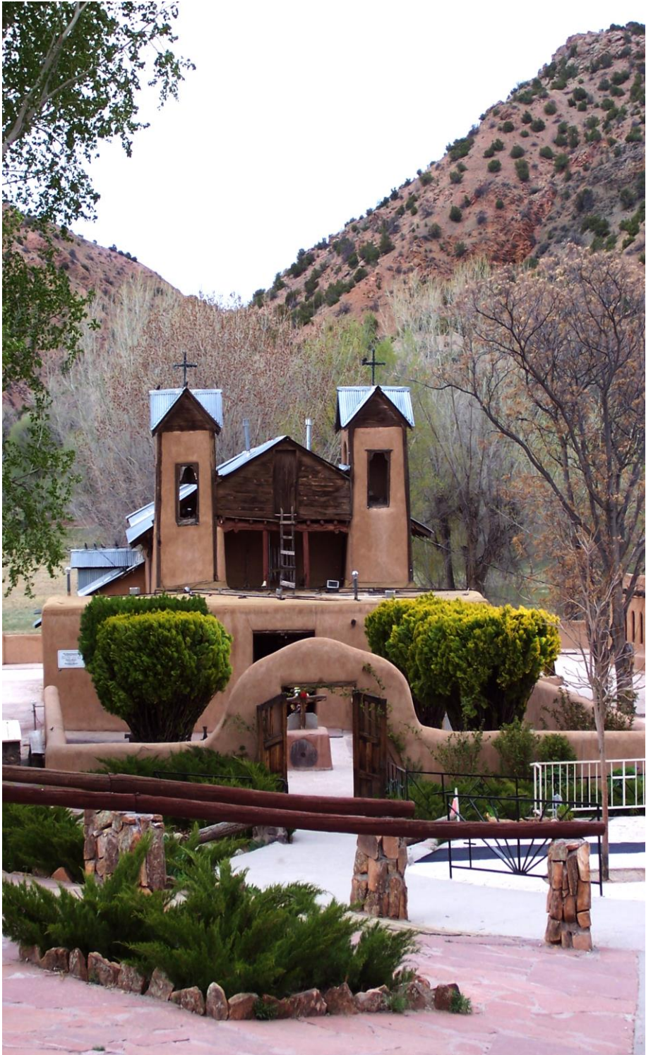
Sanctuario de Chimayo

7th Sunday after Epiphany February 20, 2022